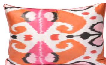
Baku blush cushion, Kushaan kushaan.co