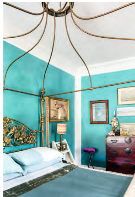
CLOCKWISE FROM LEFT: Castellini Baldissera in the striped green terrace; the rooftop swimming pool; the peacock blue master bedroom.

“A home should be comfortable and have some element of fantasy”