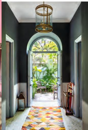
CLOCKWISE FROM BOTTOM: The Georgian green hallway; the zingy pink drawing room; a view to the garden.