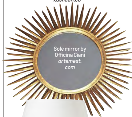
Sole mirror by Officina Ciani artemest.com